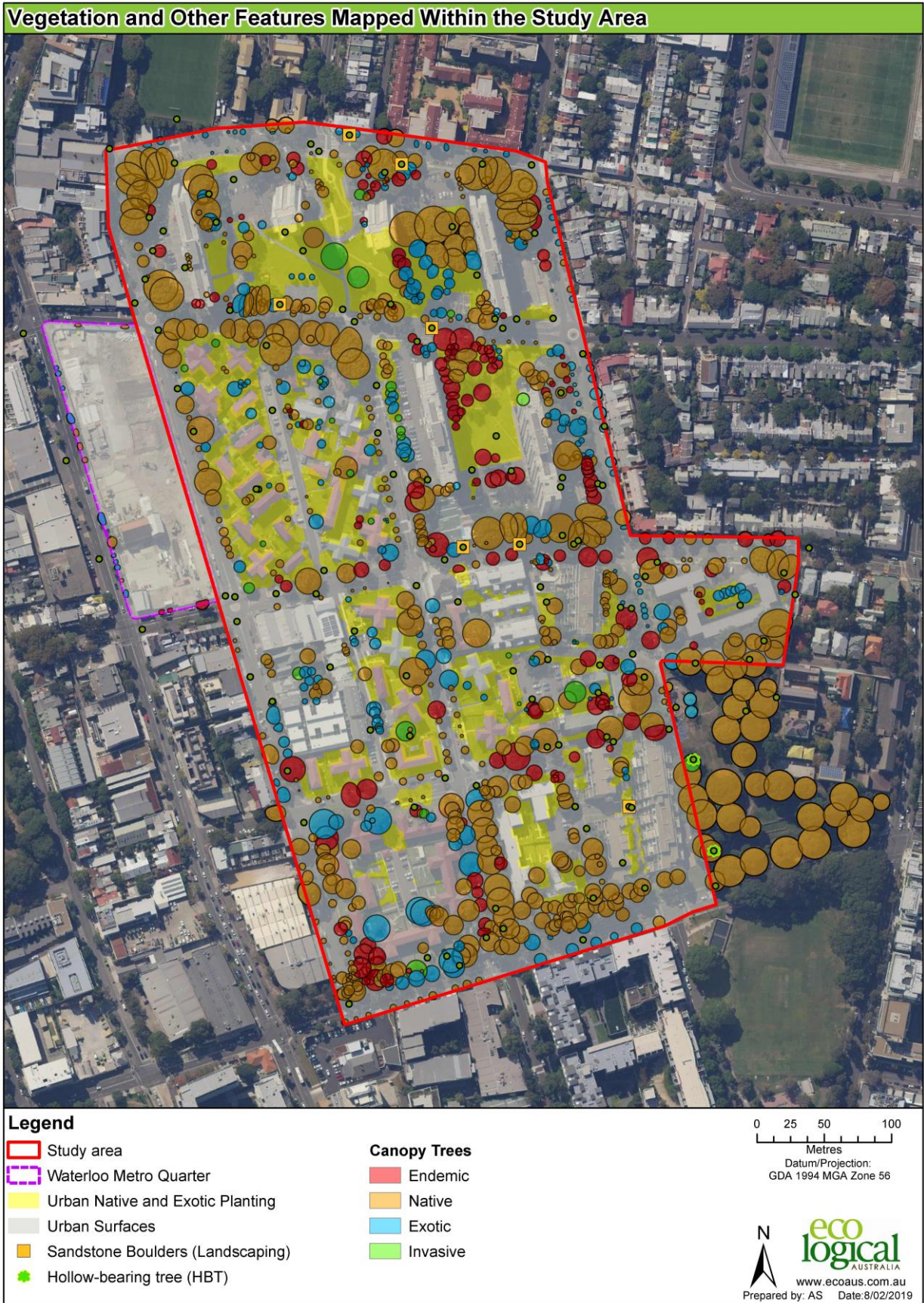
Figure 4: Vegetation mapped within and adjacent to the study area