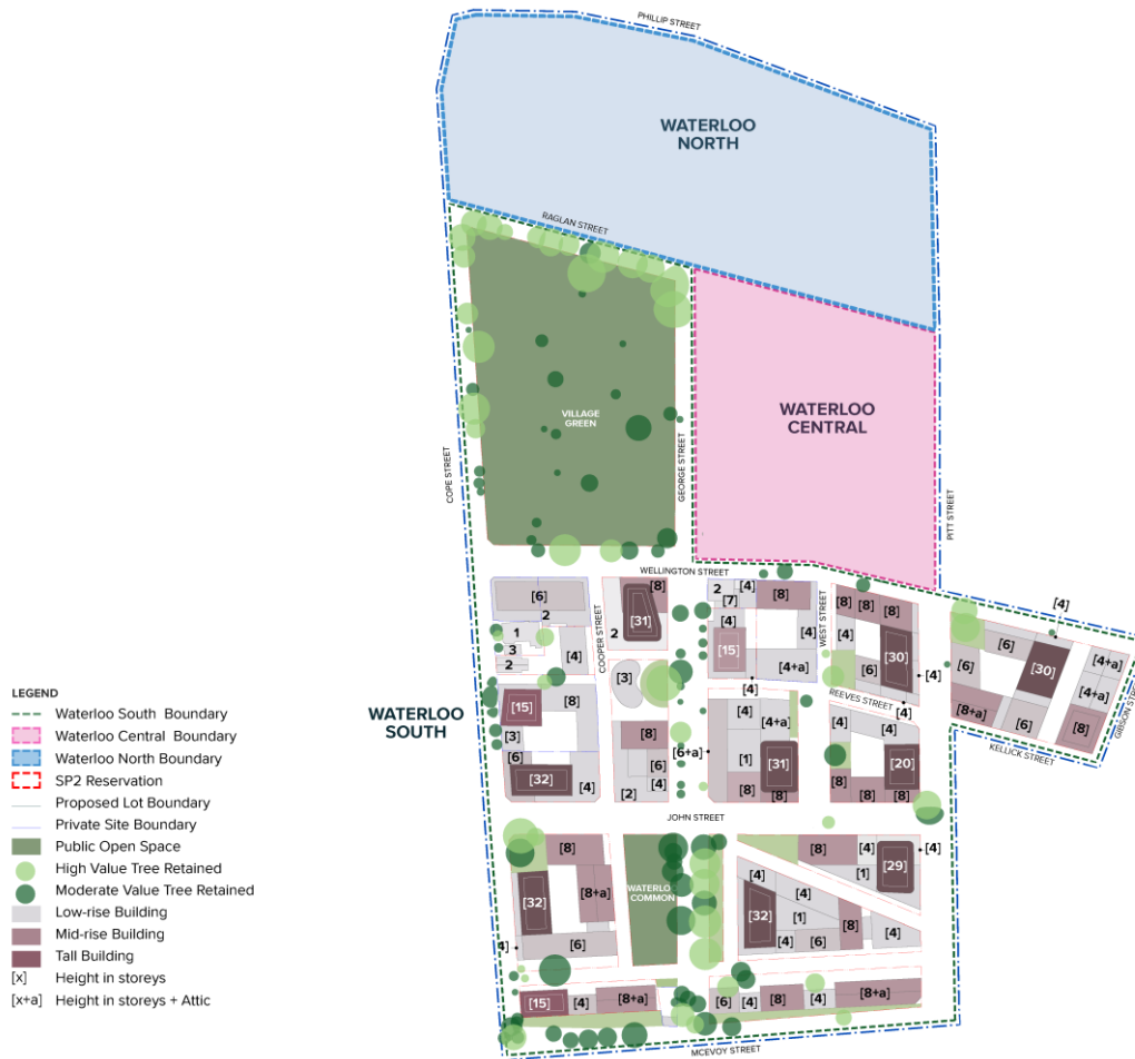
Figure 7: Plan of Indicative Concept Proposal