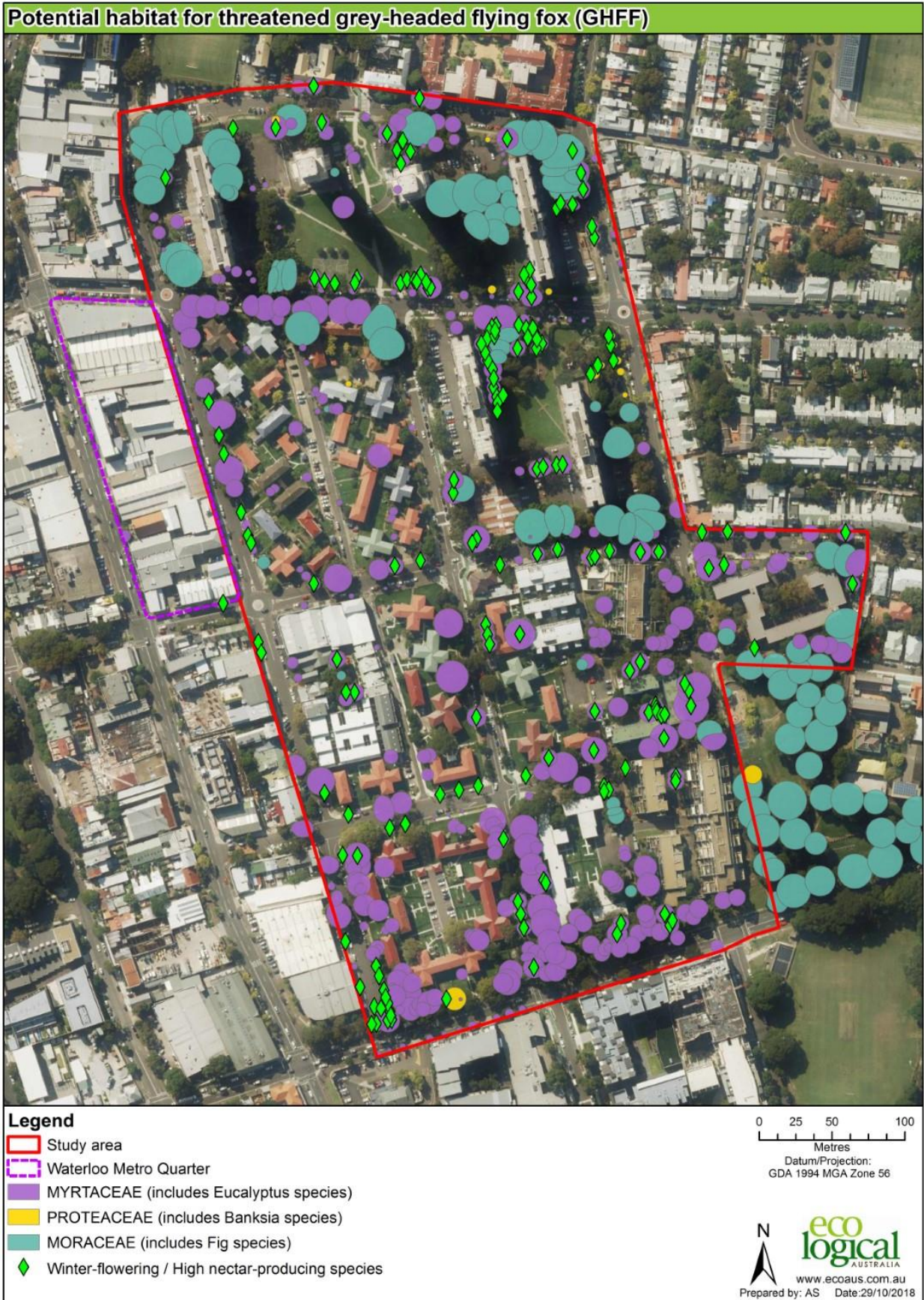
Figure 5: Potential foraging habitat for GHFF within the study area