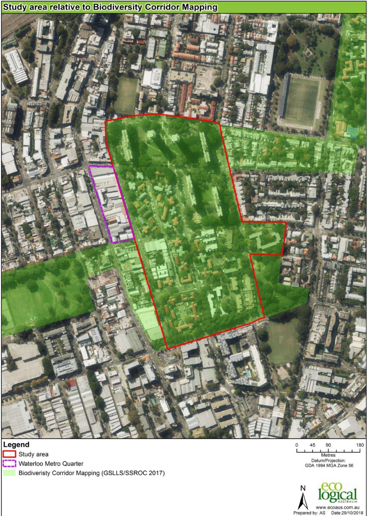
Figure 3: Study area relative to Biodiversity Corridor Mapping (GSLLS 2017)