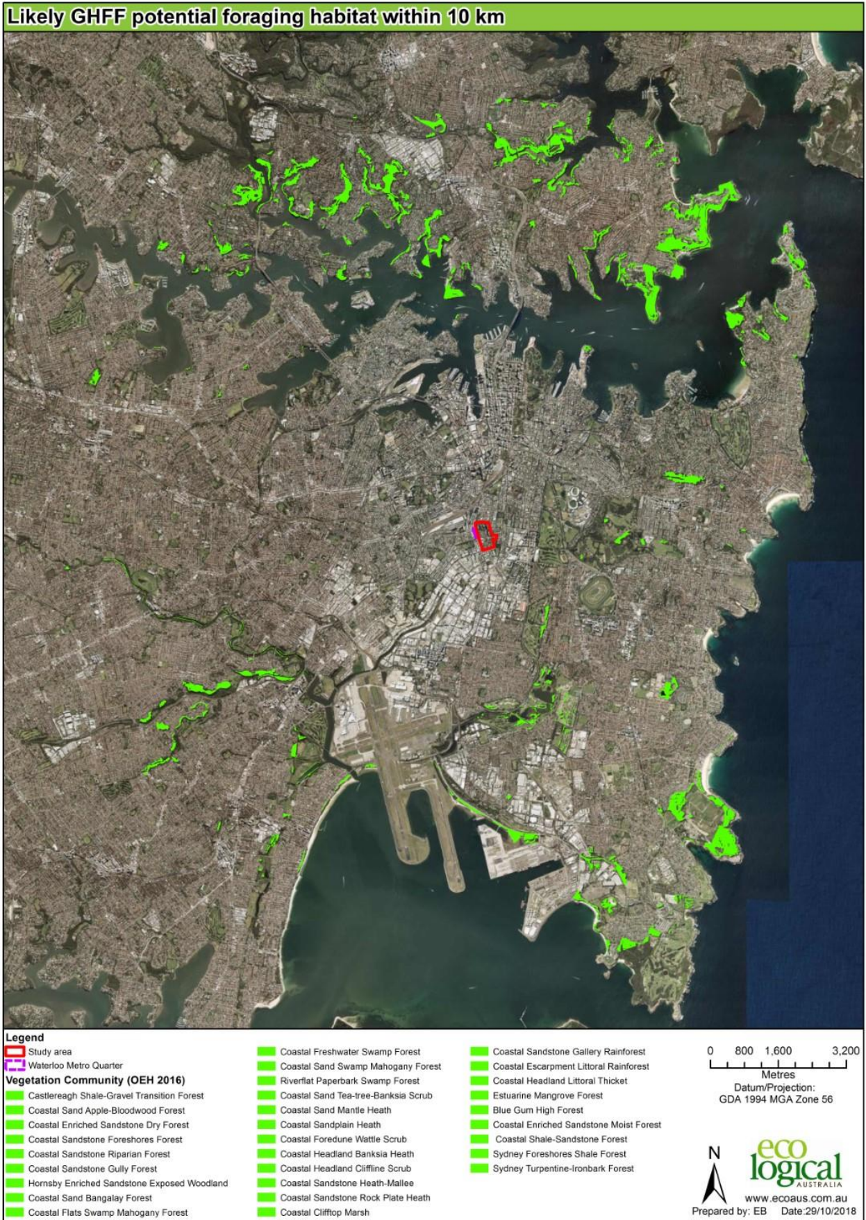
Figure 8: Likely potential foraging habitat for GHFF within 10 km of the study area and Waterloo South