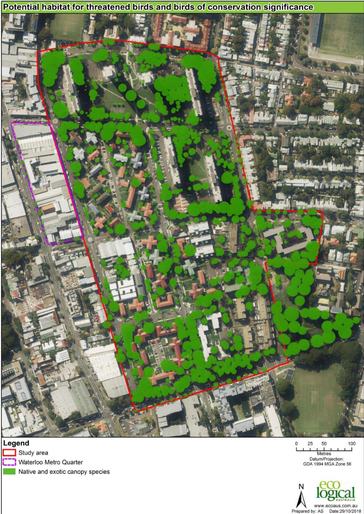
Figure 6: Potential habitat for small birds